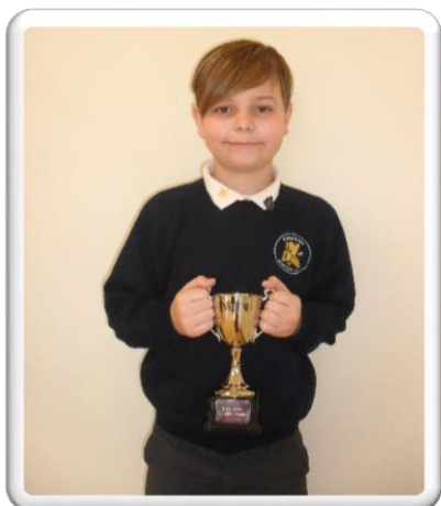
The winning House Captain