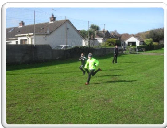
The finish in sight