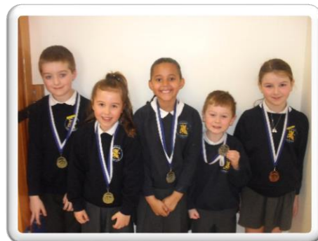
Key Stage 1 medallists