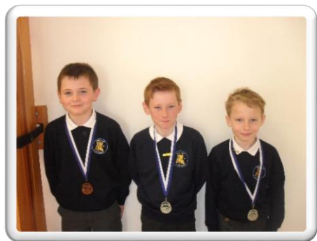
Key Stage 2 Boys medallists

Our thanks are extended to the staff from St Patrick's for joining us for the event and specifically to the team of parent helpers from Kirkistown who helped mark out the course, marshal the event and take finishing positions. Without this support, the event would not have been possible.