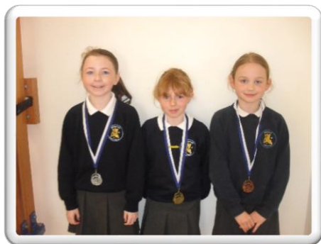
Key Stage 2 Girls medallists