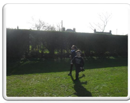
Runners on the final lap